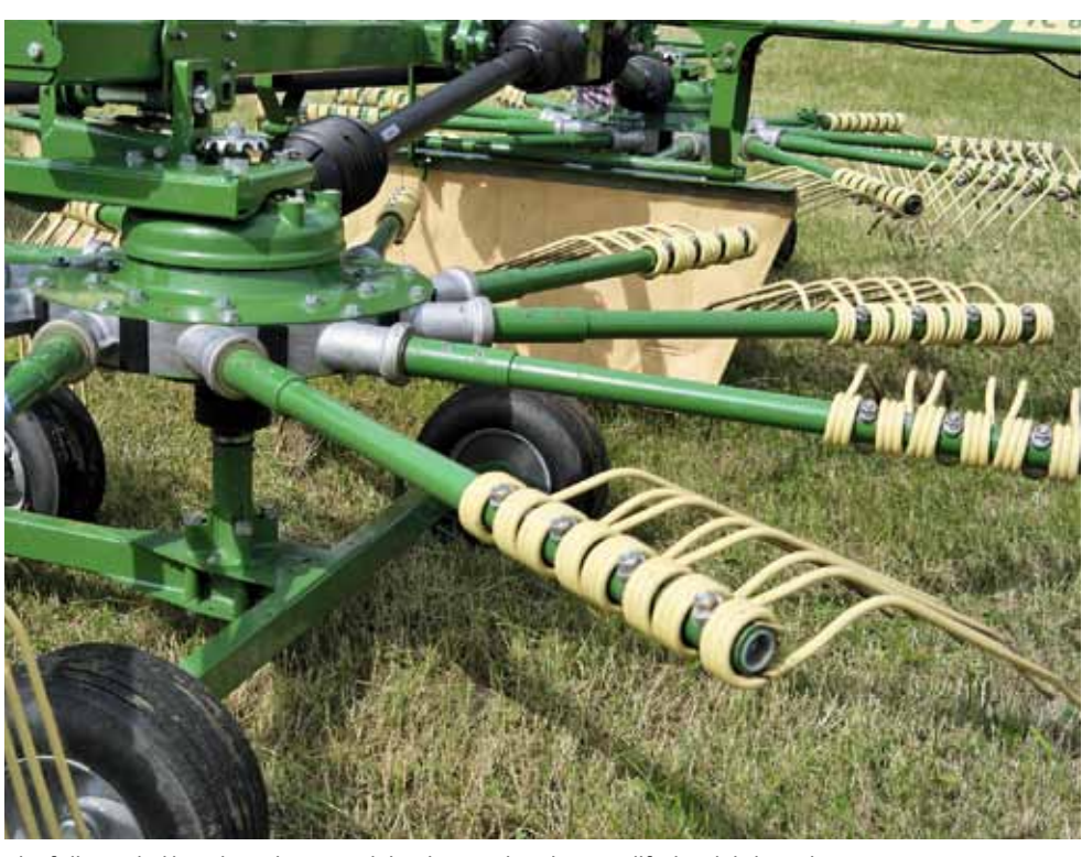
The fully-sealed bevel gearboxes and the tine arm bearings are lifetime lubricated. The bearings are made from robust cast aluminium and are connected gap-free with the arms.

Even so, by way of compromise, the arms are equipped to take a fourth pair of tines, so buyers who prefer four double tines can easily retrofit an extra pair. The Krone lift tines have kinked ends that allow them to work vertically, meaning that the tines can be set higher and work at higher ground speeds reducing the chance of contamination. The cardanic suspension allows the rotors to pivot through a +/-5° range in axial direction and +/-7° across the direction of travel, which should be enough for good ground hugging in most circumstances. After all, we had no complaints about