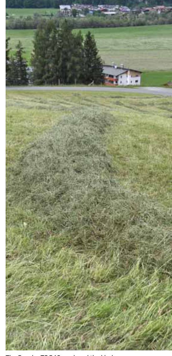
The Swadro TC 640 produced the kind of fluffy and uniform swaths that are typical of centre-delivery rakes.

Although the twin-rotor rake requires operators to change their driving and steering from what they are used to with a single-rotor machine, this is a skill that is soon learnt. So to sum up, the Swadro TC 640 is certainly a worthwhile option for small-scale and mid-sized faramh